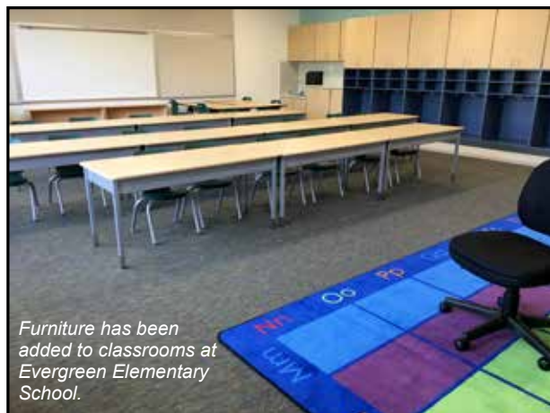
Furniture has been added to classrooms at Evergreen Elementary School.