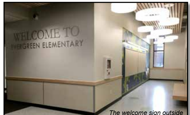
The welcome sign outside the administration office of Evergreen Elementary School.

New furniture has been installed and district information technology services staff is installing computers and telephones for staff and teachers.