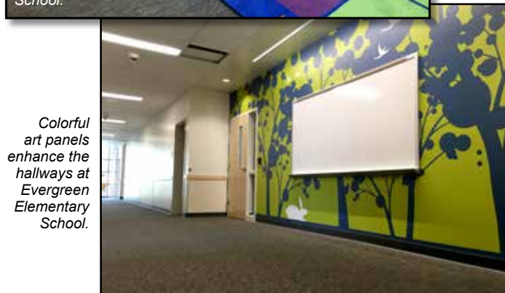
Colorful art panels enhance the hallways at Evergreen Elementary School.