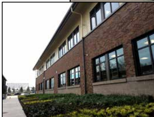
Landscaping is complete at Evergreen Elementary School.